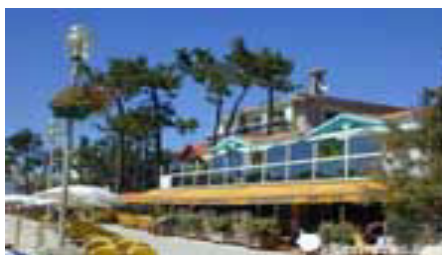
Nausicaa Plage de Saint-Palais Promenade de Steisslingen 17420 Saint-Palais-sur-Mer Tél. 05 46 23 14 78