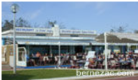
Restaurant de la Mer, Chez Bruno 181, avenue de la Grande Côte 17420 Saint-Palais-sur-Mer Tél. 05 46 23 35 85