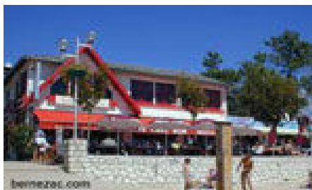
Chez Bob Plage de Saint-Palais Promenade de Steisslingen 17420 Saint-Palais-sur-Mer Tél. 05 46 23 11 10