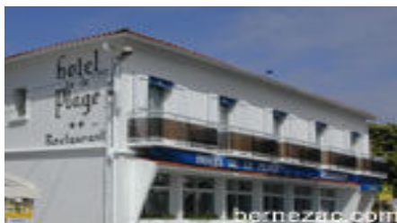
Restaurant Hôtel de la Plage 1, place de l'Océan 17420 Saint-Palais-sur-Mer Tél. 05 46 23 10 32