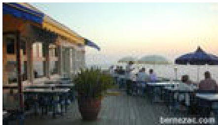
Le Petit Poucet Pointe de la Grande Côte 17420 Saint-Palais-sur-Mer Tél. 05 46 23 20 48