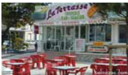
La Terrasse Place de l'Océan - Plage de Saint-Palais 17420 Saint-Palais-sur-Mer Tél. 05 46 23 25 94